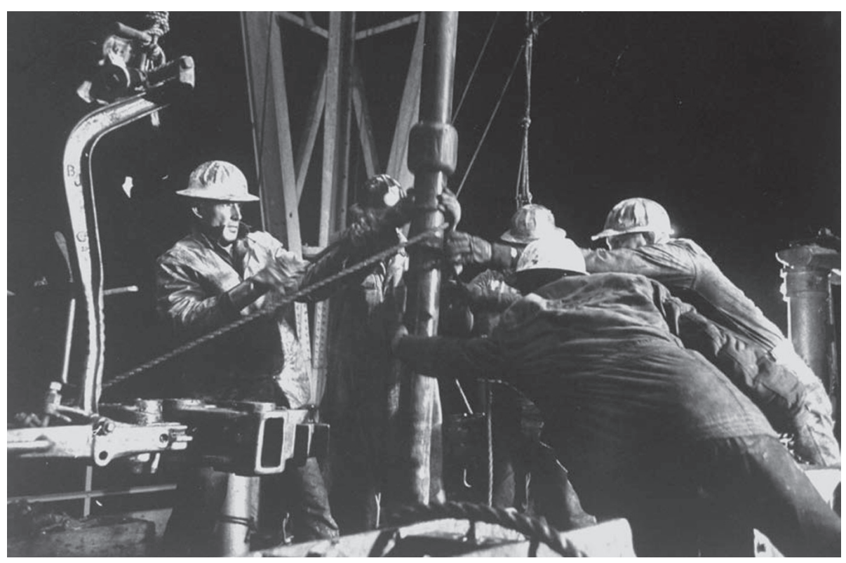
This 1961 effort to drill right through Earth's crust didn't succeed. Half a century on, geologists are ready to try again.