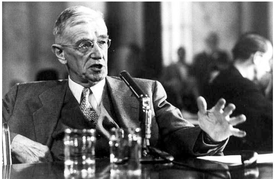
Engineer Vannevar Bush's proposals led to the creation of the National Science Foundation in 1950.

The influence of Science — The Endless Frontier stems largely from its timing, coming at the tail end of a war in which science-based technology had been crucial. The development