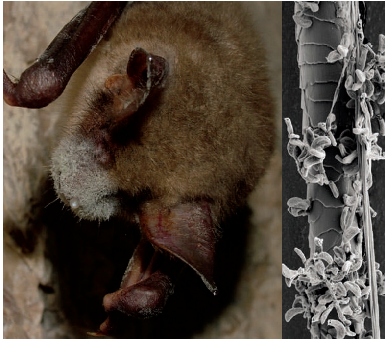
EMERGING INFECT. DIS.