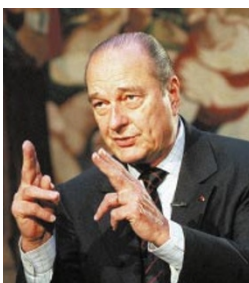
Chirac: spoke out for Soleil.

But France will only build Soleil if opposition emerges within Allègre's ruling Socialist party. Some members of the party have been critical, but prime minister Lionel Jospin has yet to make a statement on the matter. Heather McCabe