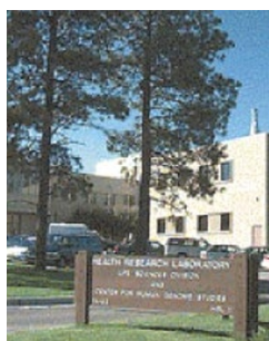
Under threat? Los Alamos health research laboratory.

The establishment of the agency is supported by many researchers at the three huge weapons laboratories — Los Alamos and Sandia in New Mexico, and Lawrence Livermore in California. They hope it will free them