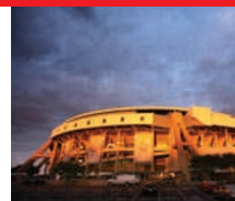
STADIUM DEMOLITION A BOON TO SCIENCE American football's loss may be seismologists' gain. www.nature.com/news