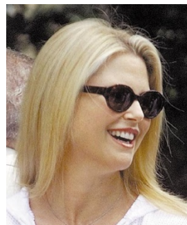
Model pressure? 'Supermodel' Brinkley expressed opposition.