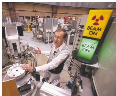
Off for good: the High Flux Beam Reactor.