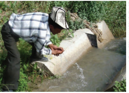
Canals in many Asian regions are in dire need of maintenance.

The report also suggests that governments should support and regulate extraction from groundwater aquifers by individual farmers, rather than condemn the practice. For a longer version of this story, see <a href="http://tinyurl.com/news-2009-826">http://tinyurl.com/news-2009-826</a>