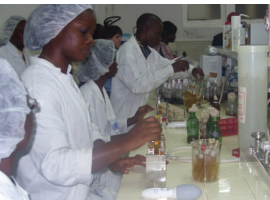
The number of accredited labs in Africa may rise.

The US Centers for Disease Control and Prevention in Atlanta, Georgia, which will implement the step-by-step system, estimates that it could see 60 currently