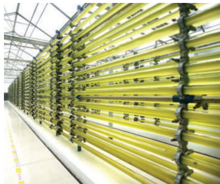
Green power: these tubes of algae are geared up to produce biofuel.

Synthetic Genomics will receive $300 million — more, if deemed successful — to develop high-yielding algal strains and their large-scale cultivation. Exxon is spending an equal sum internally on engineering and manufacturing expertise to support the research.