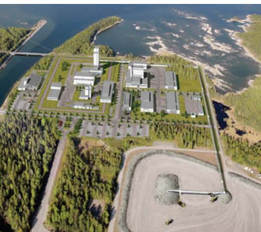
SKE A mock-up of Sweden's nuclear-waste store.