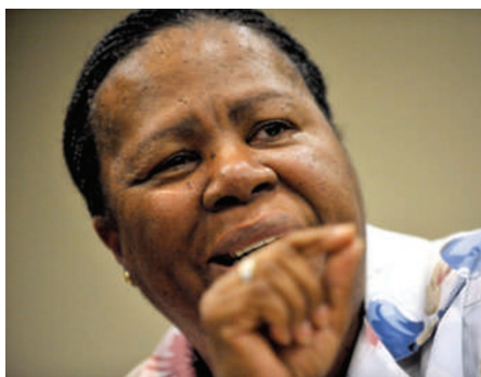
Naledi Pandor has been appointed science minister.

For a longer version of this story, see http://tinyurl.com/qczrtg .