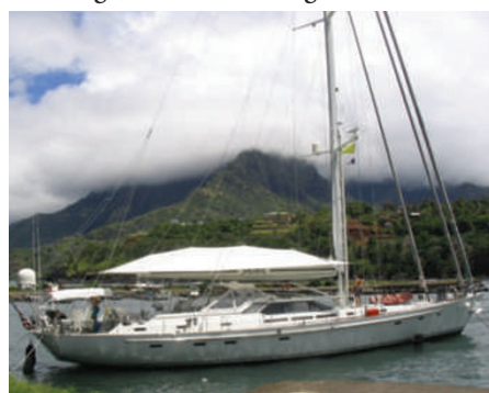
Setting sail: Sorcerer II is heading out to sea again.

Flanked by dense human populations, the three seas are likely to paint a portrait of human effects on microbial populations, he says. The project is expected to cost around US$10 million and will be funded by the Beyster Family Foundation in San Diego, with additional grants from-