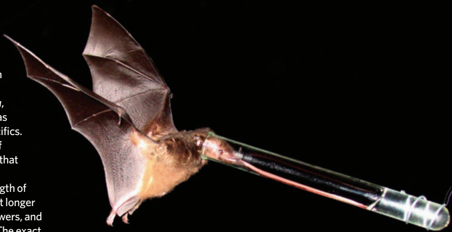
N. MUCHHALA & J.D. THOMSON

The duo experimentally manipulated the length of the flower Centropogon nigricans and found that longer tubes delivered more pollen to bats in male flowers, and took more pollen from bats in female flowers. The exact mechanism, however, remains unknown.