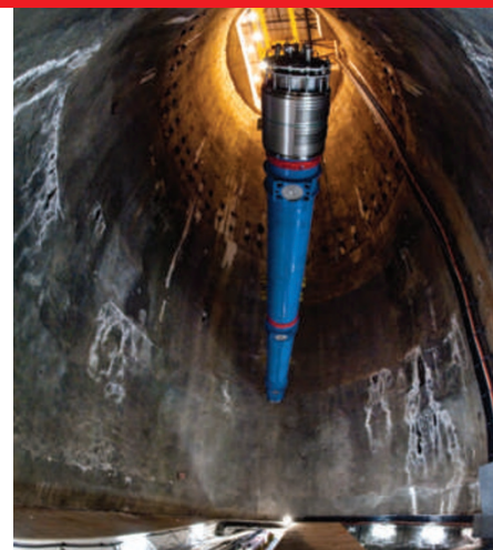
A superconducting magnet is removed at the LHC.

With a short technical stop over Christmas, the LHC will run through to autumn 2010, but it will accelerate its protons to just 5 teraelectronvolts (TeV),