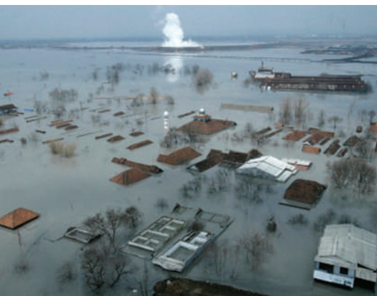
The Sidoarjo mud volcano has caused widespread devastation.

Mud has been spewing from a former rice paddy in Sidoarjo in East Java since 29 May