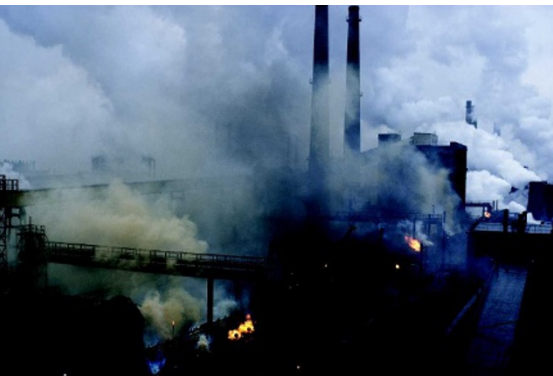
Europe's industry is facing tough emissions rules.

The committee backed a number of contested changes. From 2013, the power sector will have to acquire all of its emissions allowances at auction, instead of getting them for free. Large manufacturing industries that compete internationally will be gradually phased out of free allowances from 2013 to 2020 — but the threshold for exemption will