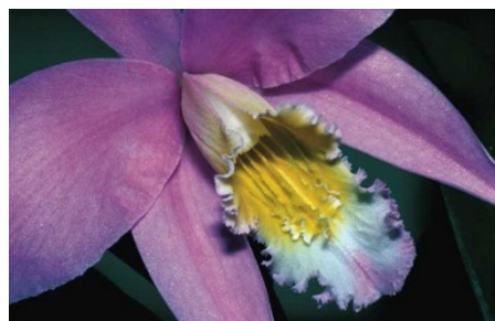
Botanical gardens are shying away from orchids.

David Roberts of the Royal Botanic Gardens in Kew, UK, and Andrew Solow of the Woods Hole Oceanographic Institution in Massachusetts, compared the rate at which two botanical gardens in the United States collected two kinds of plant: orchids, many of which are covered by CITES, and bromeliads, of which very few are. They found that before the convention was ratified, the institutions were collecting three orchids for every bromeliad, but after this time the ratio fell to just 1:1.