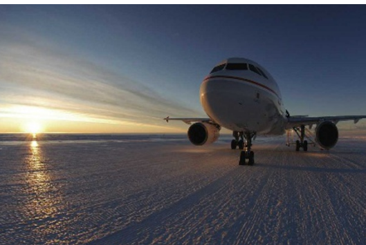
A plane sits on the new ice runway in Antarctica.

Such details are not required under current rules; the report recommended that this change. But the NIH disputed that advice, saying that if it agreed to accept detailed reports, it would be held accountable for oversight duties that are properly the job of grantees' institutions.