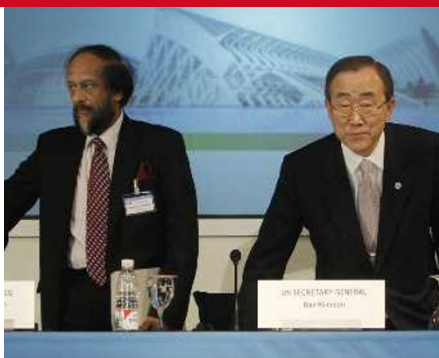
IPCC chairman Rajendra Pachauri (left) and UN secretary-general Ban Ki-moon at the release of the climate body's synthesis report.

The report confirms that it is at least 90% certain that global warming is real