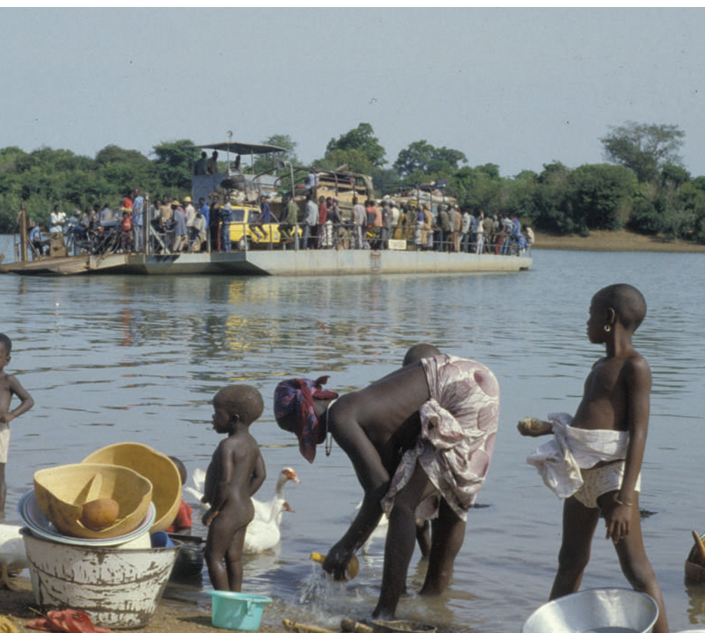
Few effective medicines are available to treat diseases prevalent in tropical regions.

probability that the targets will bind to drug-like molecules).