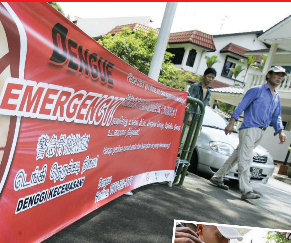
Fever pitch: citizens of Singapore are urged to help prevent the spread of dengue fever. Officials are checking homes for signs of mosquitoes breeding.

Dengue is an almost exclusively urban disease — the WHO describes it as a “man-made problem related to human behaviour”.