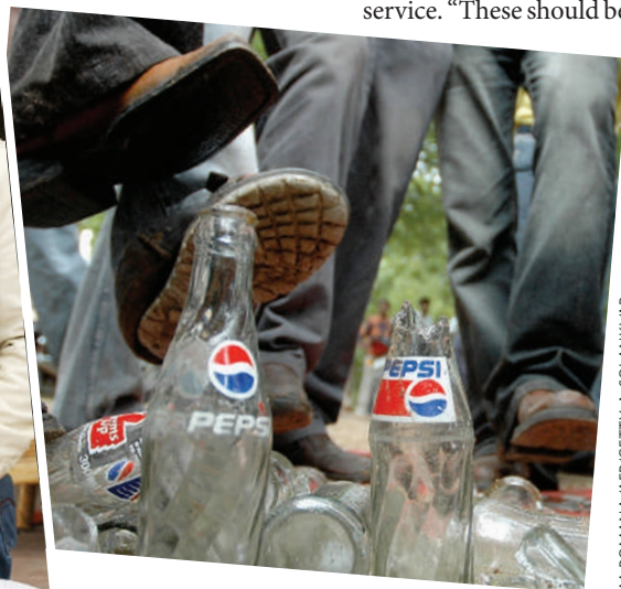
Coca-Cola has recruited actor Aamir Khan (left) to boost its image, while students protest by smashing bottles.