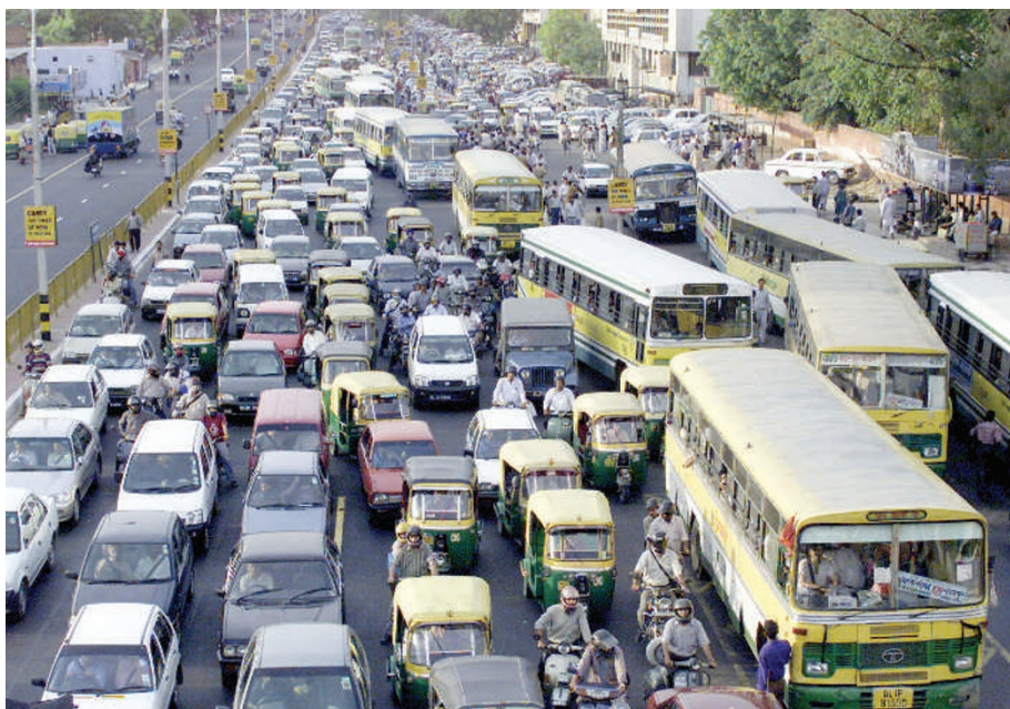
The Centre for Science and Environment forced Delhi's public transport to switch from diesel to gas.

Today the CSE employs 125 journalists and researchers, about half of whom hold degrees