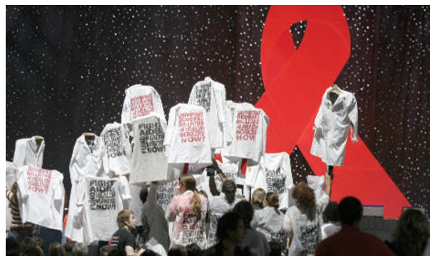
This year's AIDS conference focused on new preventive methods.