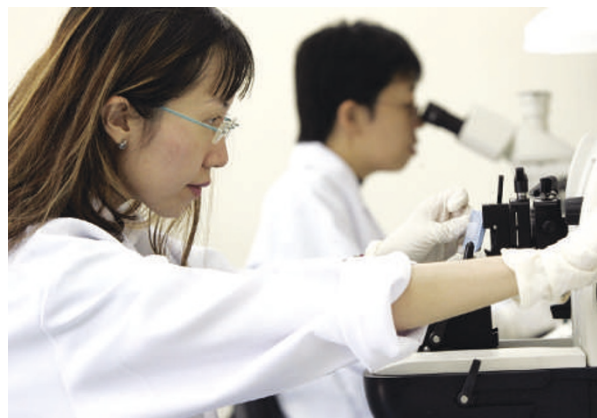
Will investment in research help Singapore keep its competitive edge?