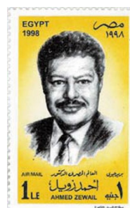
Zewail: honoured in his native Egypt.

Zewail has pioneered the implementation of this scheme. His early experiments focused on the simplest case: unimolecular