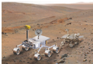
Top dog: the Mars Science Laboratory (left) will dwarf today's rovers (right).

through time. The less dust covering the rocks, the better. The site must also be navigable for a wheeled rover, without too many obstacles. And particularly prized will be areas where scientists believe water once settled in quiet pools that may have provided habitats for ancient martian life (see