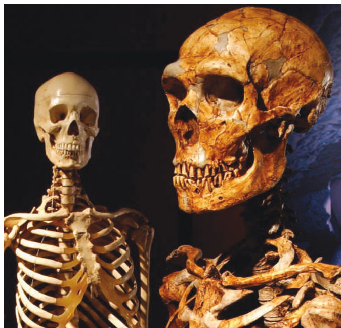
Neanderthal (right) DNA should shed light on the human genome.