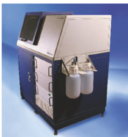
IonWorks Quattro from Molecular Devices.

clamp market is Molecular Devices of Sunnyvale, California, which merged last year with imaging specialists Axon Instruments. Molecular Devices has two high-throughput automated patch-clamping systems that can collect between 100 and 2,000 patch-clamping data points a day, depending on configuration.