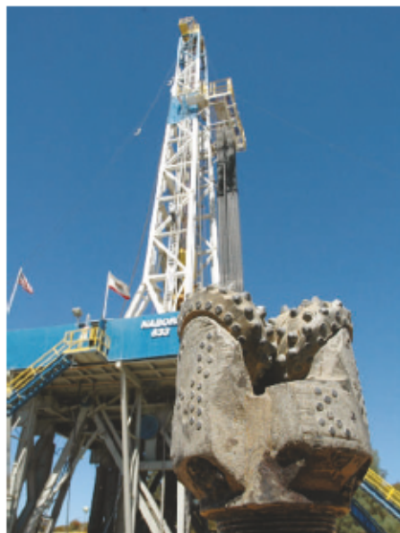
Cutting through: the project to drill into the San Andreas fault has hit pay dirt.