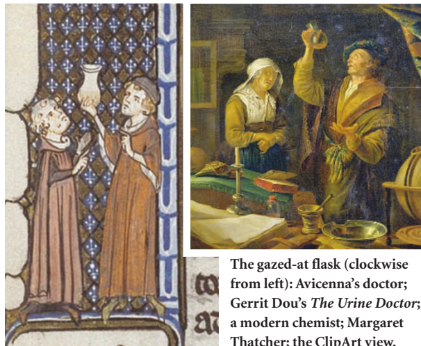
The gazed-at flask (clockwise from left): Avicenna’s doctor; Gerrit Dou’s The Urine Doctor ; a modern chemist; Margaret Thatcher; the ClipArt view.