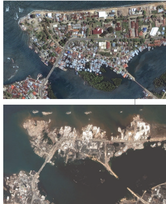
The tsunami driven by an oceanic earthquake caused widespread destruction, as shown by these views of Banda Aceh, Indonesia, before and after the disaster.