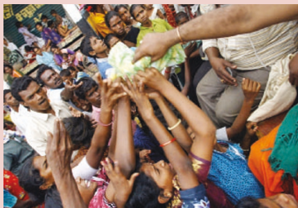
Relief centres in India have been inundated with people in need of food and aid.