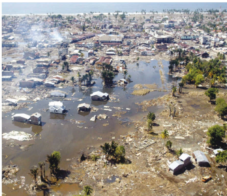
Devastated: the shattered remains of Meulaboh in Indonesia, largely destroyed by the tsunami.

Although the small global community of tsunami researchers had expressed some concerns about the risk of such an event, little had been done to plan for it. "It is