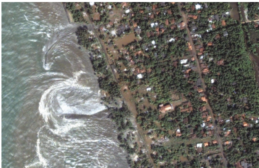
Turning tide: the waters of the Indian Ocean tsunami recede after battering the coast of Sri Lanka.