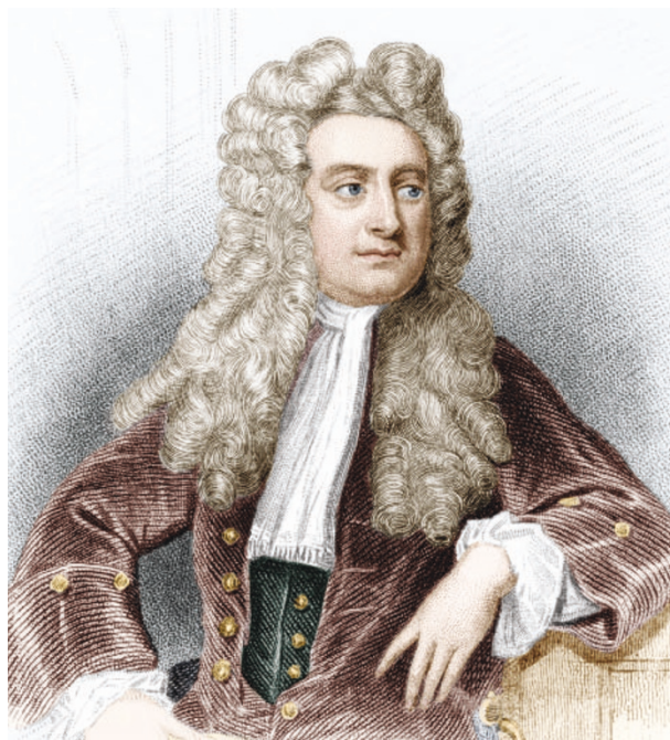
Revelation: the majority of Newton's writings were theological tracts.