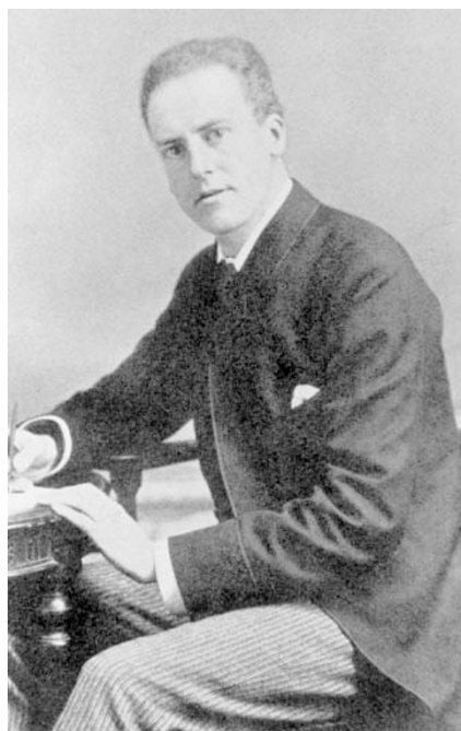
Karl Pearson’s statistical analysis provided early support for Darwin’s theory of natural selection.