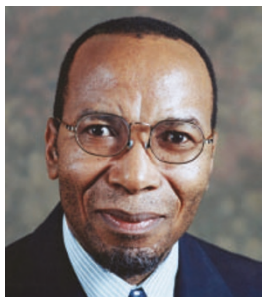
Mosibudi Mangena plans steps to woo young scientists.

Mangena, a former political prisoner and exile, is the head of a tiny minority left-wing party, the Azanian People's Organisation, which secured only one seat in parliament in the recent elections. He was previously deputy minister of education. But because