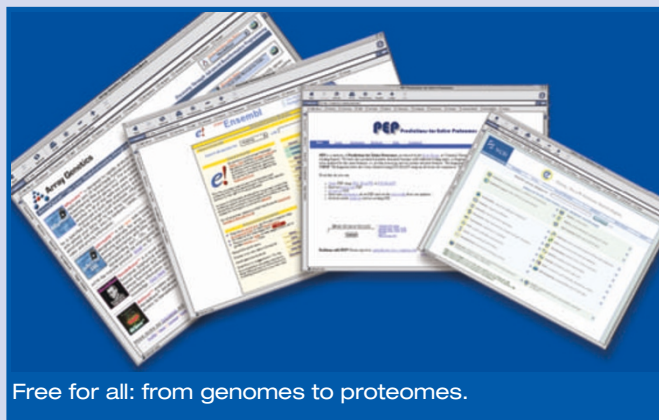
Free for all: from genomes to proteomes.