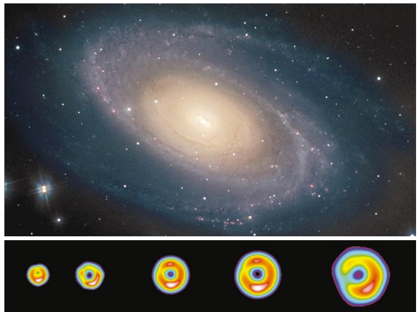
Figure 1 The beautiful spiral structure of the galaxy M81, one of the brightest galaxies in the sky. In 1993, a dying star in one of the arms of this galaxy exploded in a supernova, now called SN1993J. Radio-wavelength images 13 (lower images) trace the development of SN1993J over the first year of its existence.

If this is the case, then there must be a process by which the outer parts of the progenitors are removed before they explode. Stars can lose mass through winds (such as the solar wind of our own Sun), but this method is not efficient enough to explain the mass loss in