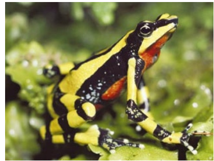
Figure 2 Absent amphibians. Both the golden toad ( Bufo periglenes , top) and the Monteverde harlequin frog ( Atelopus sp.) were found in the mountainous Monteverde region of Costa Rica, but have not been seen since the late 1980s. New DNA evidence indicates that the latter was a yet-unnamed species (R. Ibañez, personal communication). The disappearance of these amphibians, linked to declines in mist frequency ascribed to global warming 6 , might be due to climate-related outbreaks of an emerging pathogen.

between climate and recent extinctions is essential, the patterns implicating global warming in such losses attest to the urgency of Thomas and colleagues' principal recommendation 7 . Reducing the concentrations of greenhouse gases — and reducing them soon — could minimize this warming and hence the number of extinctions. The threat to life on Earth is not just a problem for the future. It is part of the here and now. ■