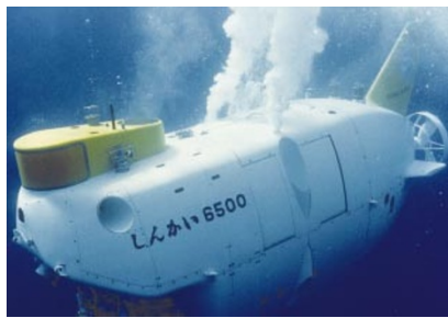
Depth charge: Shinkai 6500 gives researchers a rare glimpse of the deep ocean’s delicate jellies.

After catching the jellies, there is still the challenge of getting them out of the deep and into the light of day. “We manage to trap them in containers at these great depths, but we