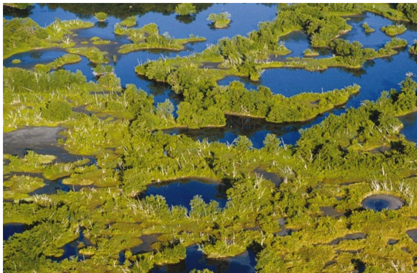
Bittersweet business: a flow of phosphorus from sugar farms poses a threat to Florida's wetlands.

Ecologists want phosphorus levels to be kept below 10 parts per billion (p.p.b.), but levels are as high as 80 p.p.b. in some water flowing into the Everglades. As a result, a 'phosphorous front' has been gradually encroaching on the wetlands at around a kilometre per decade, says ecologist Evelyn Gaiser of Florida International University in