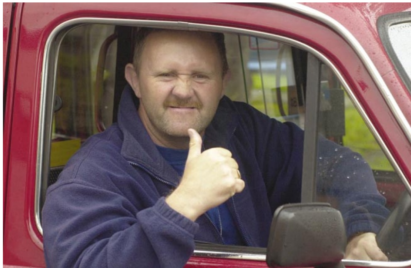
Fare play, guv: London cabbies have a big hippocampus, according to an Ig Nobel-winning study.

This year, one lucky spectator won a date with a proper Nobel laureate, Richard Roberts (Physiology or Medicine, 1993), also known as Mr December in the 1997 “Studmuffs of Science” calendar. Another got to meet Stephen Wolfram, who promised to explain his intense 1,200-page tome A New Kind of Science over a cup of tea.