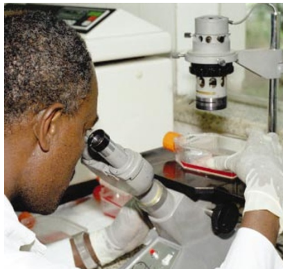
Closing in: a worker at Ethiopia's National Polio Laboratory in Addis Ababa.