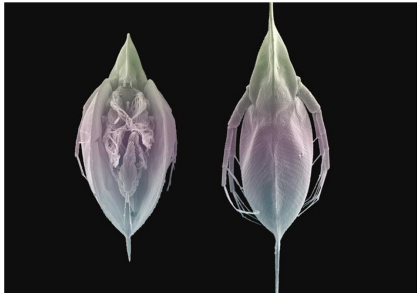
Spot the difference: the water flea Daphnia readily changes shape in response to its environment.