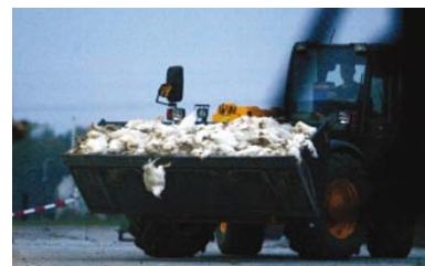
Disease burden: 18 million Dutch chickens have been culled in the fight against bird flu.