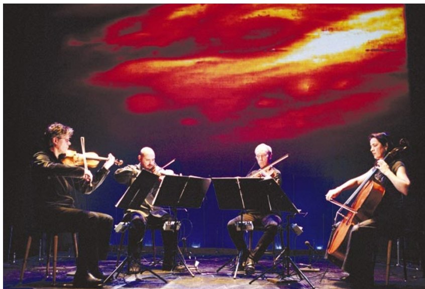
String theory? The Kronos Quartet perform Sun Rings against a backdrop of images of the Universe.

Although these often rather personal and historical sidelines might be of particular interest to science historians or researchers working on microbial genomics, these specialist readers would not want to be bothered with explanations of how the polymerase chain reaction works, for example. But such techniques and other introductory and background information will presumably be of interest to the non-specialist reader who would like to discover what genomics is all about. This kind of reader might need more explanation of some of the basic concepts in genetics and genomics, however. In some places, rather specific jargon is used which might confuse general readers. And discussion of alternative DNA-sequencing techniques is probably beyond most uninitiated readers. ‘Automatic’ sequencing techniques have been used pretty much exclusively in genomics for 15 years now, but one of the few figures in the book shows a ‘manual’ gel with radioactively labelled DNA — rather a relic of the past. The lay reader would have profited from the inclusion of