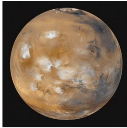
Mars, seen from the Mars Global Surveyor orbiter. The distribution of surface rock types gives clues to the planet's geological evolution.

Type-2 spectra characterize extensive areas of Mars, including the southern highlands 1 , and are present in vast contiguous areas up to 1,000 km outside and 2 km higher in elevation than the putative “shoreline” boundaries 1 . Wyatt and McSween dismiss these incongruities and do not explain them 2 ; no explanation is provided either as to how the Pathfinder landing-site analyses fit into the weathered-basalt hypothesis 2 . Some interpretations of Pathfinder data identify these as andesitic