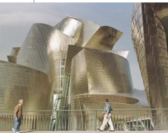
Strange beauty: Bilbao's Guggenheim museum does not conform to classical proportions.

♦ http://brain.berkeley.edu/~plaisir/conf.htm