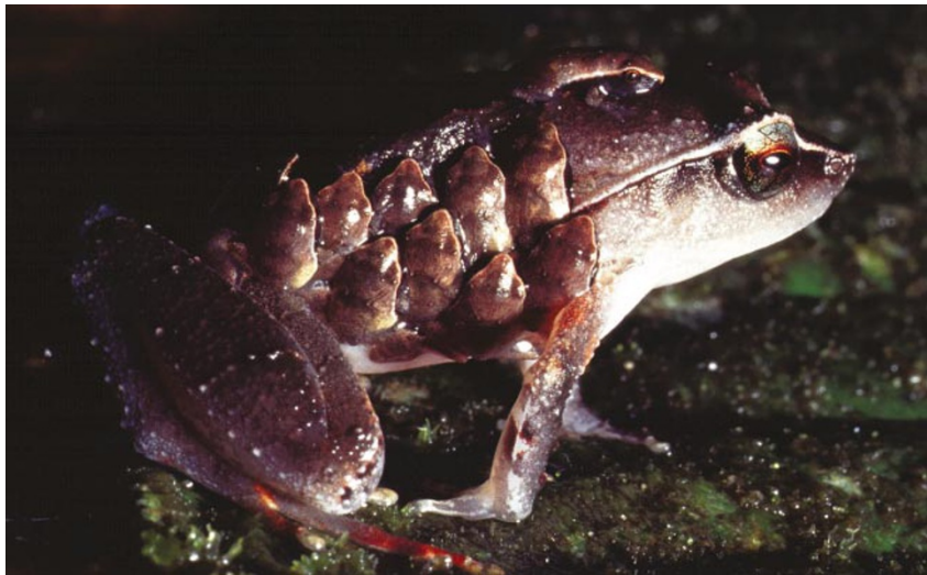
Figure 1 A male Liophryne schluginhaufeni transporting froglets. Eleven froglets are visible (out of 22 in total) on the lateral and dorsal surfaces of the adult. The froglet located on top of the father's head is preparing to jump off.

remote rainforest at 800–1,350 m, where the topography and rainfall (6.4 m per year) 2 are extreme. All microhylid frogs on New Guinea are thought to develop directly from eggs, skipping the aquatic tadpole stage and hatching as miniature versions of the adults 3 .