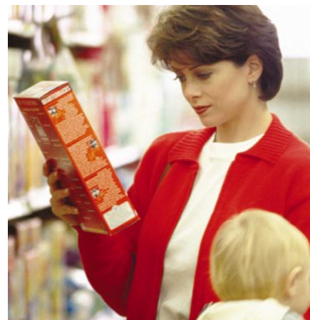
Food for thought: the public's perceived opinions on genetic modification are open to question.