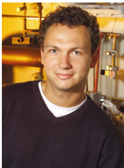
Rising star: Jan Hendrik Schön's impressive results have secured him several awards.

allegations, Schön says that he is cooperating fully with the review committee. "I'm collaborating with my colleagues to reproduce these results and show them to the committee," he says. "I am trying to focus on the science."