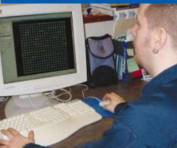
ONTARIO CANCER INSTITUTE