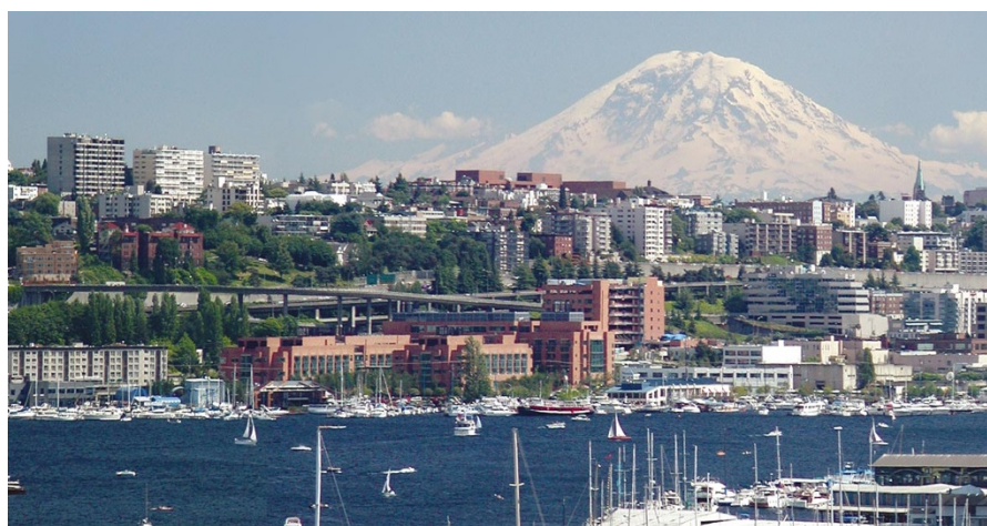
Under attack: the Fred Hutchinson Cancer Research Center was heavily criticized by The Seattle Times .

After bagging a slew of awards, "Uninformed consent" is now rumoured to be a finalist for a Pulitzer Prize, the premier award in American journalism. But with the Pulitzer