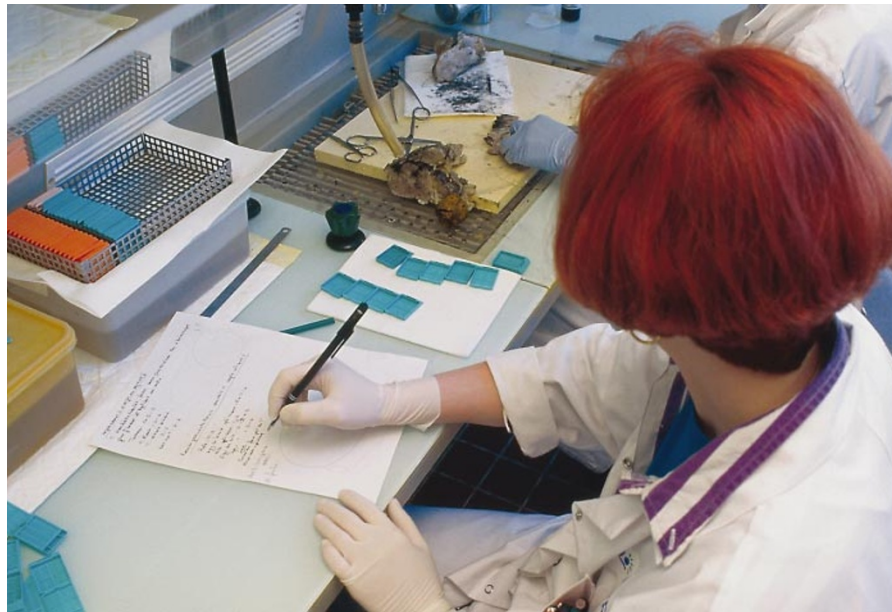
Researchers fear that current access to tumour samples is not sufficient to unpick cancer's secrets.