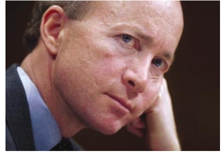
Setting standards: Mitch Daniels is a keen advocate of performance criteria for research.

Mitch Daniels, director of the OMB, told the meeting that he was strongly committed to the criteria for basic science. “Even in this most speculative area of government investment, our decisions cannot be immune from standards and quality,” he said.