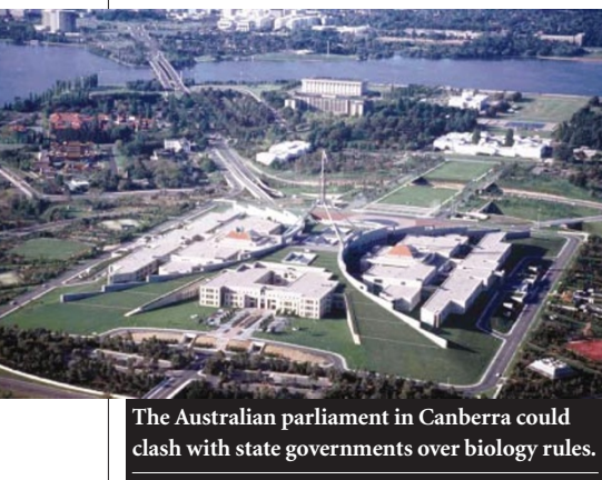
The Australian parliament in Canberra could clash with state governments over biology rules.

The federal government and the states — several of which are governed by the opposition Labor Party — look set to clash on the issue, probably delaying implementation of the agreement reached last year to establish nationally consistent rules by June. ■