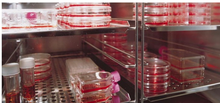
Wise investment? A new cell bank will make stem cells far more readily available to researchers.

Coming on top of recent British regulations, which are among the first in the world to endorse publicly funded research on embryonic stem cells, science administrators hope that the cell bank will help to foster world leadership in the emerging field of regenerative biology.