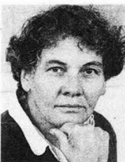
Nurse (top), Townsend (middle), and Nüsslein-Volhard.